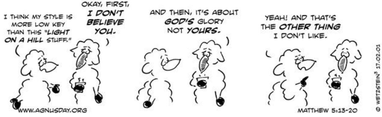
Agnus Day appears with the permission of <a href="https://www.agnusday.org/">https://www.agnusday.org/</a>

https://www.biblegateway.com/resources/commentaries/IVP-NT/Matt/Christians-Must-Obey-Gods-Law InterVarsity Press.