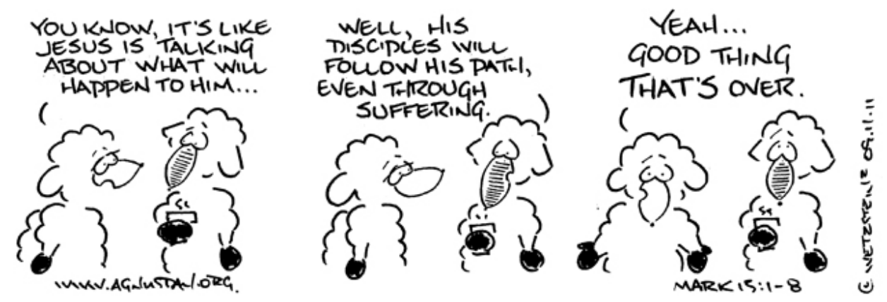
"Here at Agnus Day Central we take discipleship so seriously, that we've hired professionals to do it for us."

Agnus Day appears with the permission of <a href="https://www.agnusday.org/">https://www.agnusday.org/</a>