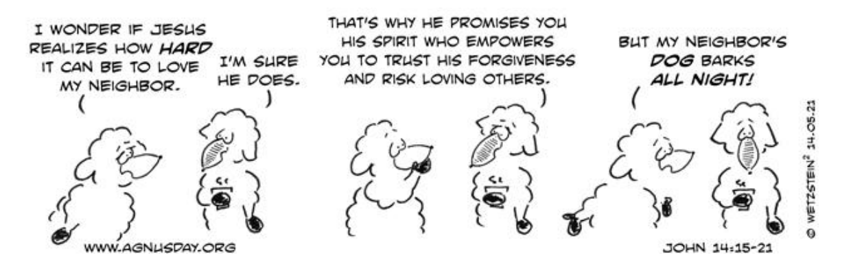
Agnus Day appears with the permission of <a href="https://www.agnusday.org/">https://www.agnusday.org/</a>